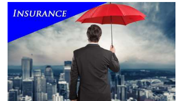
The Right Insurance and Coverage

INS | Welcome to LiveChat There's perhaps nothing 1