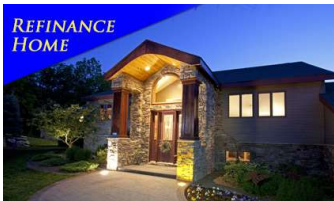
Refinance to Leverage Equity

We all want to live our own way. It's important that we do it the right way. Arapahoe CU looks to help.