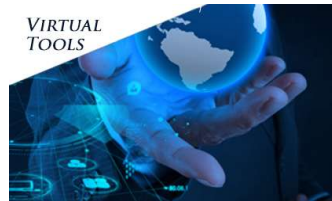
Explore the ACU Virtual Suite