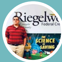
Winners of the CCNC Scholarship