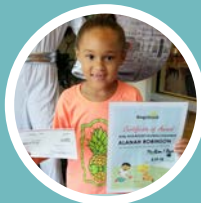
April Sweepstakes Surprise

Every time a single savings tube of quarters is filled, $10 has been saved!