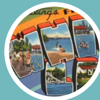
White Lake Water Park Party